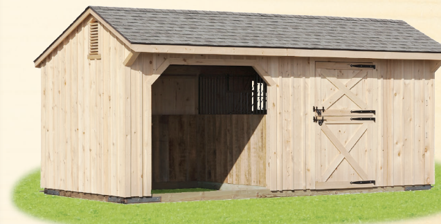
Left: 10x20 Custom Run-In Barn Shown with unfinished Board & Batten siding, one stall with a dutch door, one window, and fox hollow gray shingles. Includes optional run-in area and gable end vents.