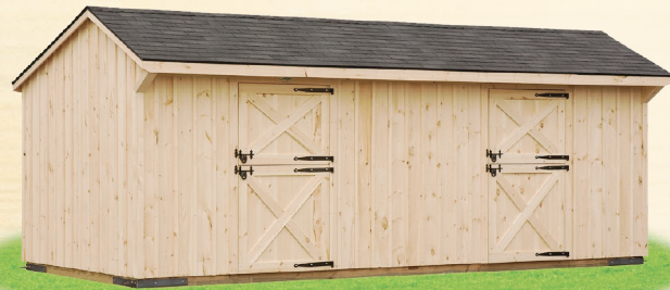
Above: 12x24 Shed Row Barn Shown with unfinished Board & Batten siding, two stalls with dutch doors, and charcoal shingles.

Enclosed Horse Barns are well ventilated and allow horses see each other while being kept separate.