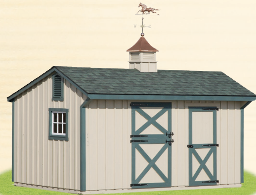
Above: 10x16 Shed Row Barn Shown with tan painted Board & Batten siding, green trim, one stall with a dutch door, one tack room, one window, and hunter green shingles. Includes optional gable vents and cupola with horse weather vane.