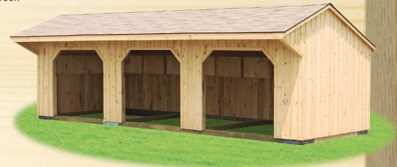
Above: 10x30 Run-In Barn Shown with unfinished Board & Batten siding, three run-in areas, and shakewood shingles. Includes optional 4' overhang.