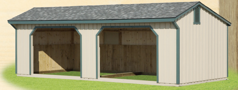
Above: 10x24 Run-In Barn Shown with tan painted Board & Batten siding, green trim, two run-in areas, and pewter grey shingles. Includes optional gable vents and drop vents.

Run-In Barns have many uses beyond the basic animal shelter. Store hay or farm equipment... or even firewood! These structures are truly versatile!