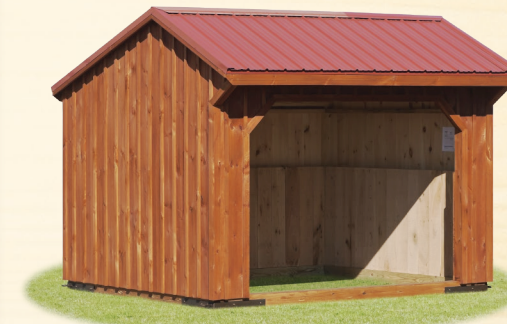
Left: 10x12 Run-In Barn Shown with cedar stained Board & Batten siding, one run-in area, and red metal roof.