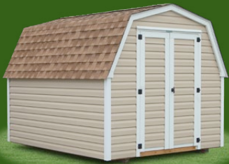
Vinyl Madison Mini Barn 8 x 10