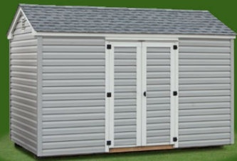
Vinyl Madison Peak 8x12