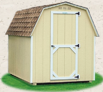
Madison Mini Barn 6 x 8