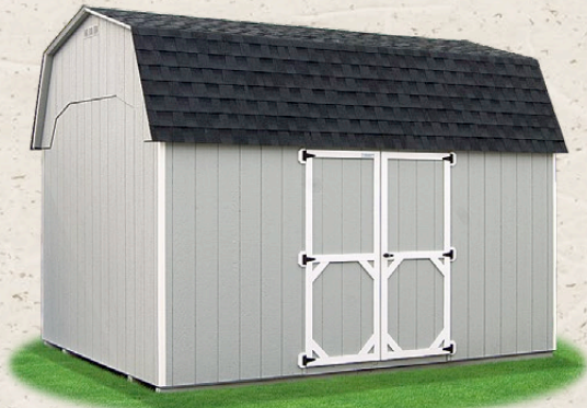
Madison Dutch 10 x 14 (Gives you ample overhead storage space plus lots of room for shelving.)