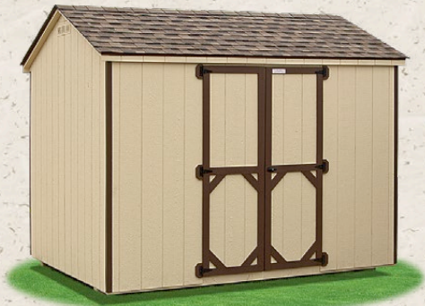
Madison Peak 8 x 10 (6' wall height allows room for wall hanging space or to install shelving.)