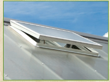
8 x 12 Greenhouse