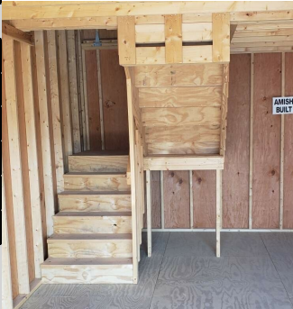
Stairs in single wide