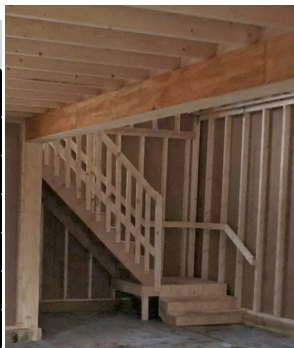
Stairs in double wide

***more sizes & sidings ***Vinyl, Board n batten, Log Siding